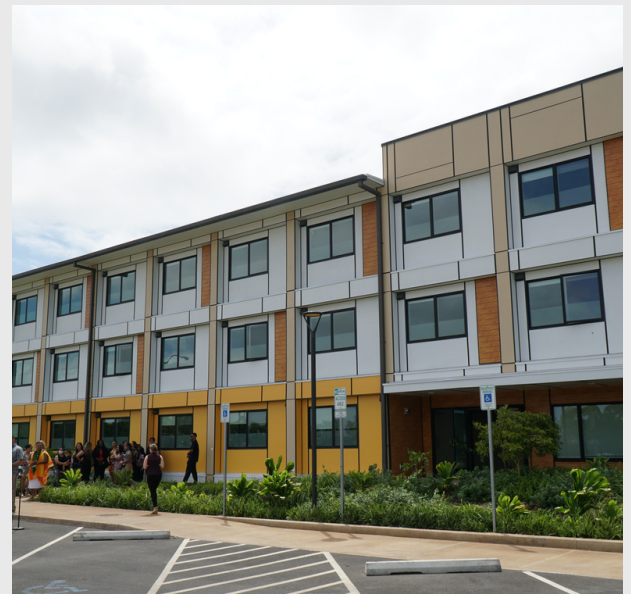
West Loch Modular affordable housing project