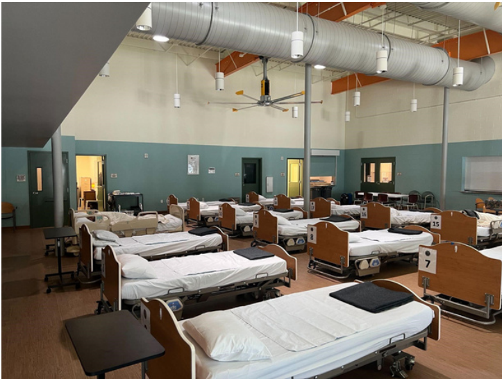
Photo taken inside of the Iwilei Resource Center.